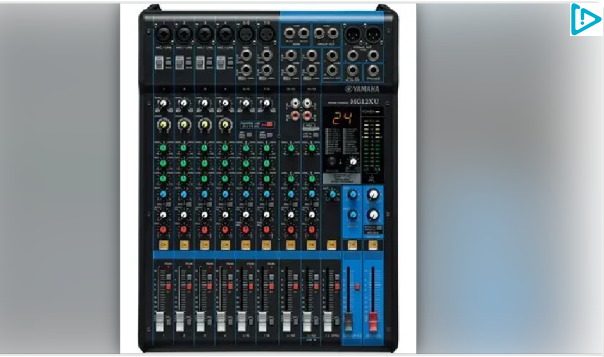
ser audio YAMAHA MG12XU ery z serii MG są niezwykle wszechstr